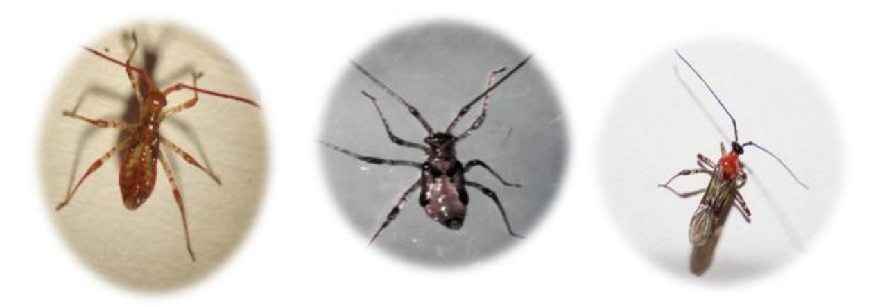
Fig.6 5<sup>th</sup>instar nymph