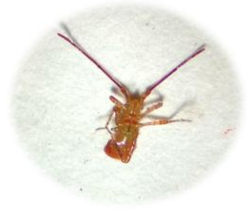
Fig.5 4<sup>th</sup>instar nymph